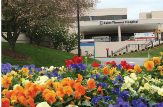
Saint Thomas Hospital, Nashville, TN, Member of the Ascension Health System