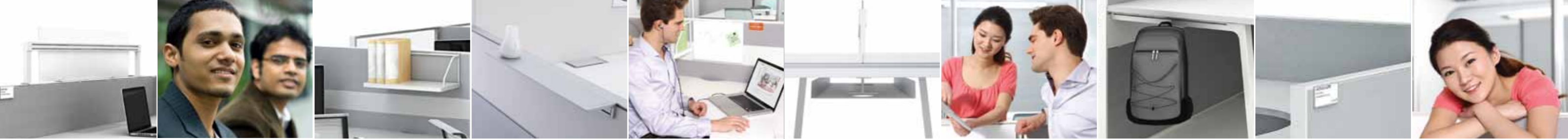
Marker board screen