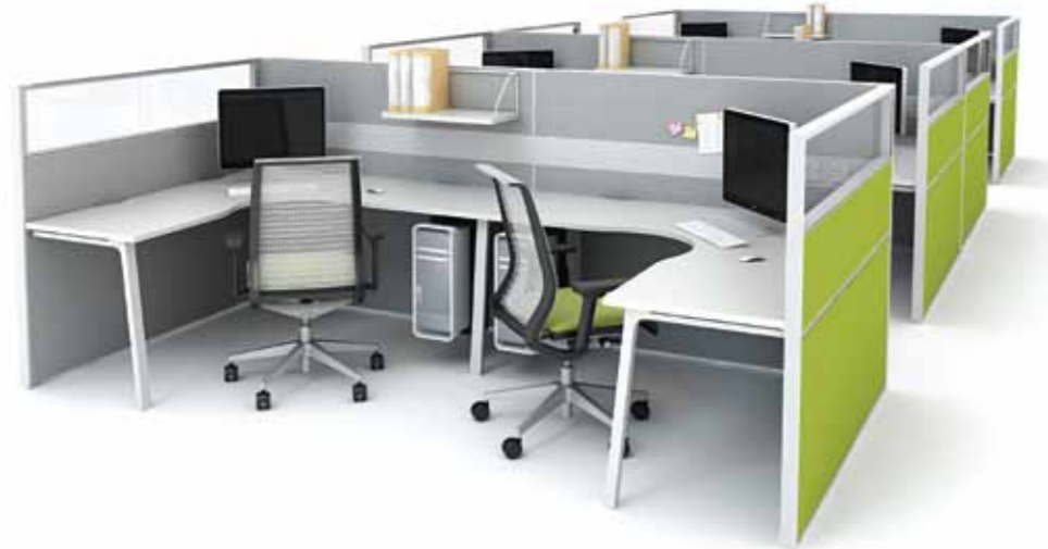
*DETAIL vertical processor sling

Lexicon is simple versatility brought to life. The available high panels, solid partitions and modular work surfaces and corner sections form the basis of a totally flexible workspace solution. One that covers every need, from bench-style meeting table to truly personal cubicle.