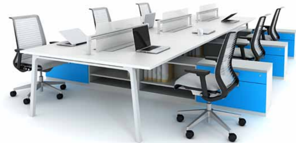
*Lexicon bench with Manifesto storage